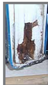
Door with Wood Stiles