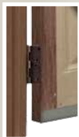
Plastpro Door with LVL Stile