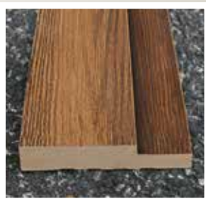
Plastpro frame with Hydroshield™ Technology